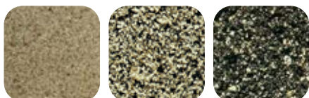
Colour examples for separately bought quartz sand

ROMPOX® - PROFI-EASY is used all around the house such as patios, footpaths and surfaces that have occasional light vehicle loads (with non settling, water permeable foundation beds). The pavement jointing mortar can be used with almost all natural stones, natural and concrete stone slabs as well as clinker stone surfaces.