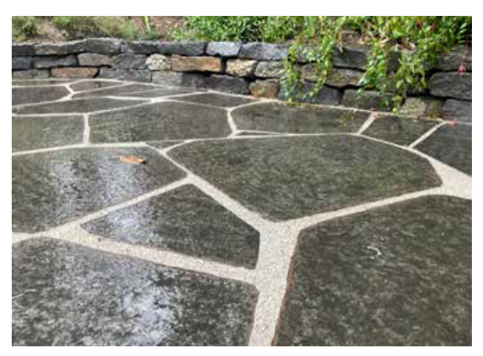
ROMPOX® - EASY installed on natural stone residential patio