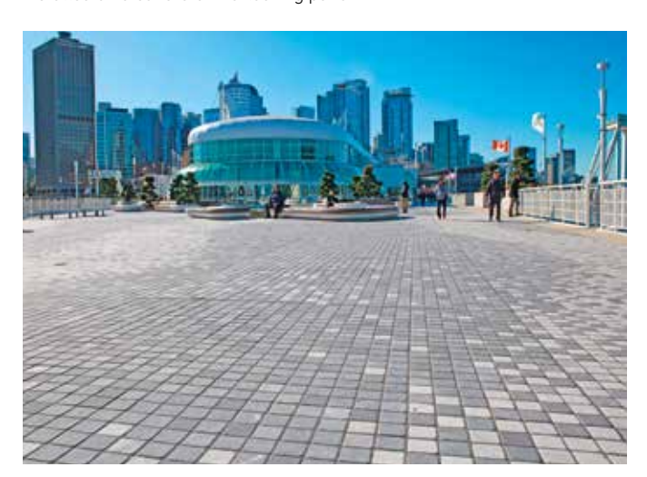
ROMPOX® - D1 installed on a natural stone commercial plaza